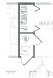
Optional Crawl Space