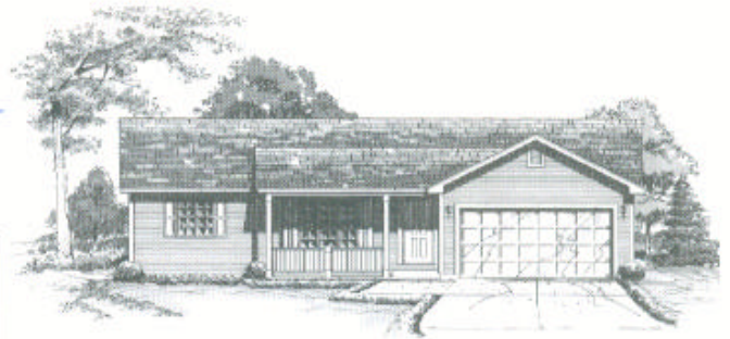
Porch and garage included as shown.