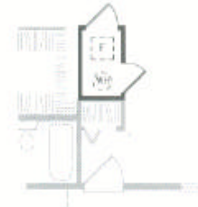
Optional Crawl Space