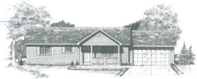
Porch is included. Shown with optional garage.

Length (with garage).....64'-0" Depth .....26'-0" Total Area.....1,144 sq. ft.