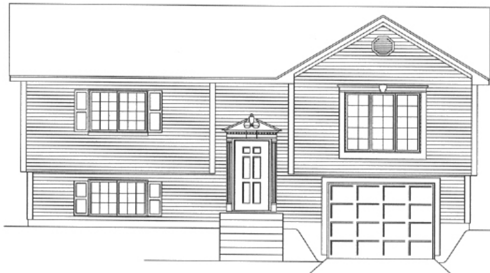
Shown with optional tuck-under garage