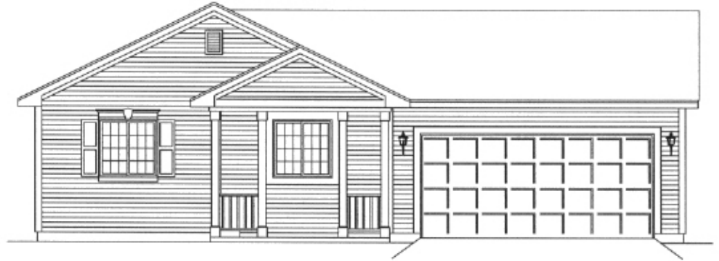
Shown with optional porch and standard garage