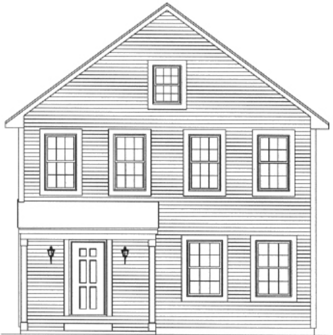
Shown with optional porch

Custom Homes built by: Hoffrogge Development Co.