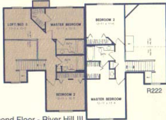
Second Floor - River Hill III

56'-0" x 43'-0" Floor Plan Layout 1318 sq. ft.